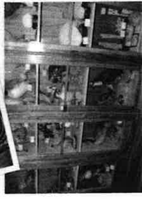
Some of the many collections available for viewing throughout the Hitchcock Memorial Museum.