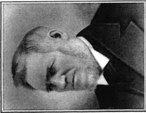
Aaron Charles Hitchcock July 19, 1823-March 1, 1900