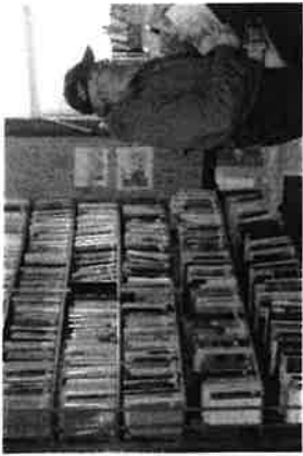
A Westfield resident selecting his weekly books.